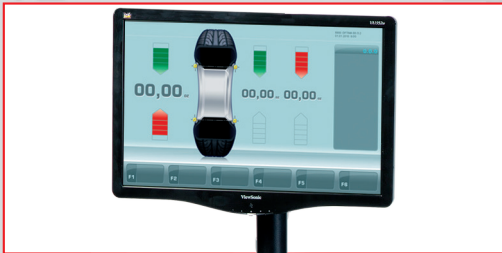
19" monitor with graphical interface