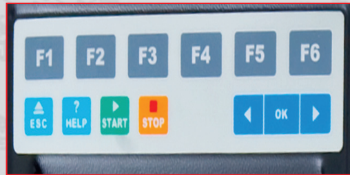
Membrane touch key