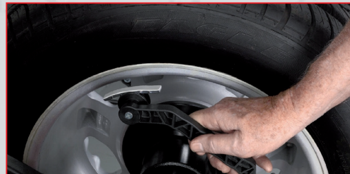
Gauge arm equipped with weight clamp retains the wheel weight in the correct position for weight placement.